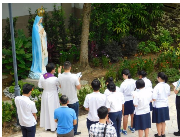
Blessing of Our Lady Garden