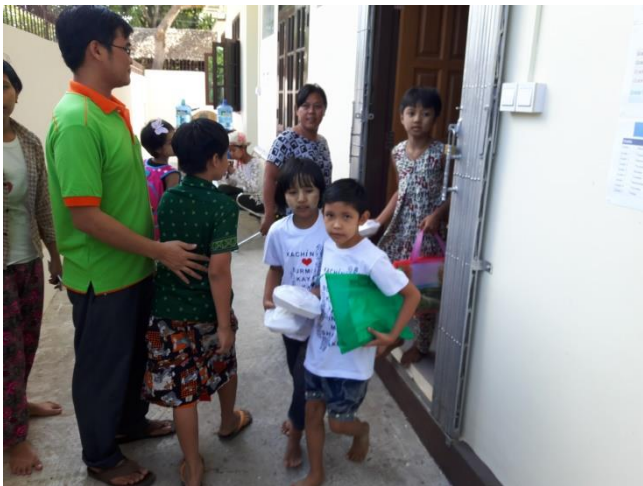
Happy children, after their classes they were treated with noodles by a donor

Programme still, but we have stopped taking new students due to class space and effectiveness purpose. In week we are going to give our students a name card to wear because there are a lot young people come to our School and we do not know which one is our student. So to be able to identify students will have to wear a student-card.