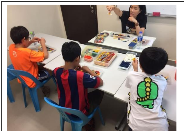
The volunteer working with our boys on an activity in building K'Nex model kits