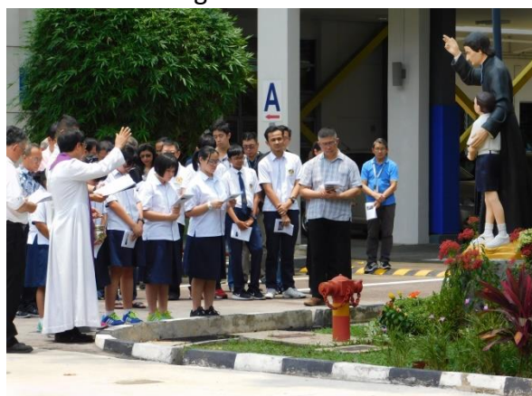
Blessing of St. Louis Marie de Montfort Garden