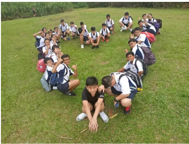
The Secondary One Students forming the 'Language of Love'

The Level Camps at Assumption English School were held from 1 March to 3 March 2017. Each of the camps had their own very own themes and learning objectives which were filled with engaging programmes and activities.