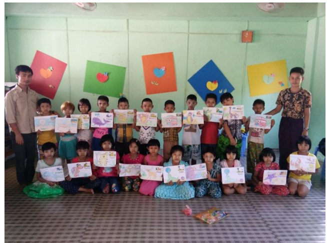
Learning corner and their products