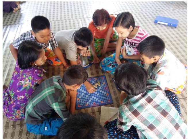
Grade-5 playing game