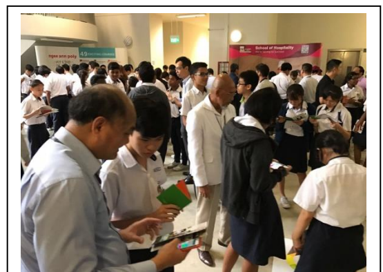
The Sec 4 and Sec 5 students attending the Roadshow of various institutions

Through the various Level Camps, we believe that our Assumptionites have forged lasting bonds by learning in a joyful manner!