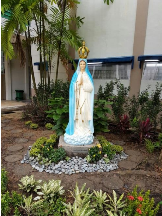
Garden of Our Lady of Fatima