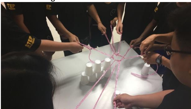
A team building activity that required control, precision and patience when working together.

We started the New Year with an Orientation Camp for our boys. It was a time for us to welcome the new boys into our Boys' Town family. It also gave a chance for staff, volunteers and boys to bond. During the camp, the boys also learned how to work as a team and to overcome challenges. One of the boys said: "For my group, we had a really bad start and at first we were really discouraged to carry on, but our team had the support of the staff and volunteers and for most of the time we managed to find solutions to all of our problems and all this happened through the games that made us communicate and start to fight back."