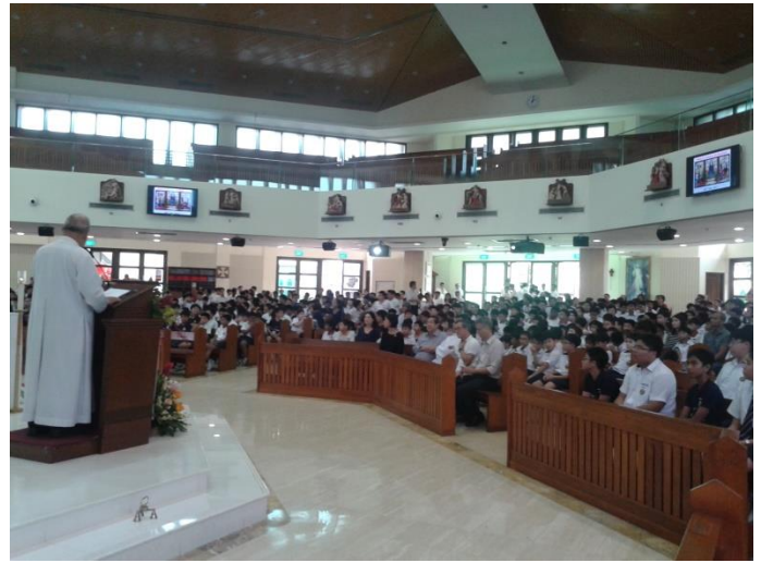
To mark the beginning of the academic year, a special mass was celebrated at Immaculate heart Mary's Church on 20 Jan 2017 for all the seven institutions of the Montfort Brothers of St. Gabriel's institutions.