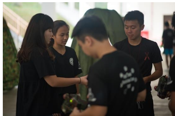
Our staff and volunteers worked hand in hand to ensure the smooth running of the camp activities.