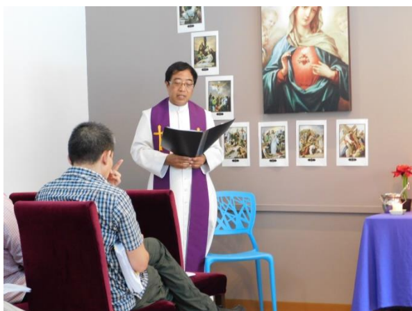
Blessing of Montfort Room