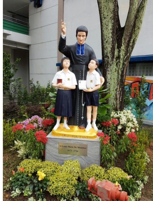
Garden of St. Louis Marie de Montfort

During the year-end school holidays, works took place to enhance the school environment. We were blessed to begin the academic year with the new Montfort Room, a place for individual quiet time or group reflections for both staff and students. The gardens were also spruced up, thus creating a more distinctive Montfortian atmosphere to reflect the school's ethos.