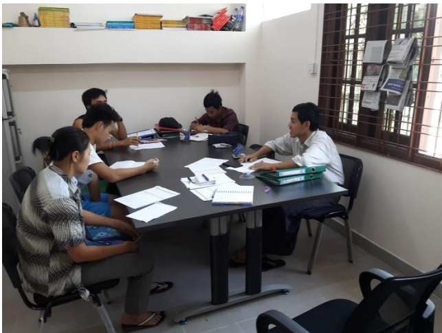
ALL-Staff Having Meeting for lesson planning and School blessing