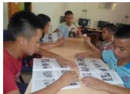
San Damiano's Boy's Hostel's Study Day