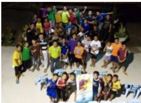
St Mary's Youth Hostel's Study Day