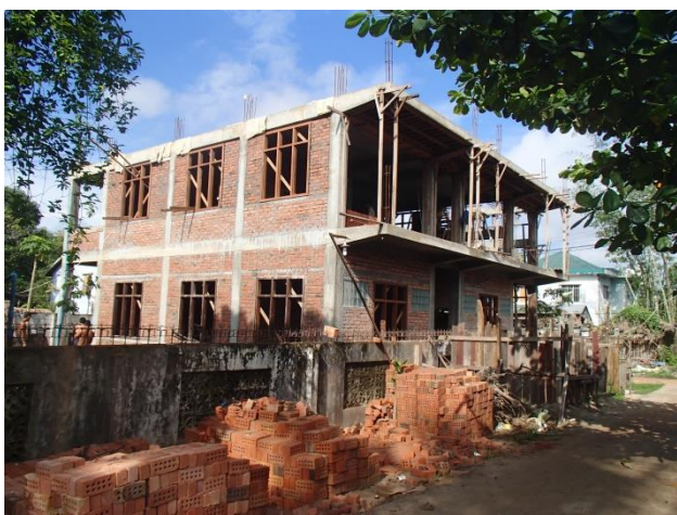
ALL building under construction

In addition to it, ALL is the learning centre for the University Distance Education (UDE) to equip them in English. This programme spans two years. Currently, there are twenty students in this programme, ten students for each year. All the classes and activities are conducted in the parish ground. Temporarily, the parish allowed the Brothers to use two classrooms in the parish building.