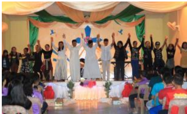
The Easter Concert

The Staff and the Boarders gathered nightly at the Prayer Room to recite the Holy Rosary during the whole month of May to mark the Month of Mary. During the prayer, the Staff led the Boarders to reflect on the life of Jesus and how each Mystery of the Rosary can assist them in their daily life.