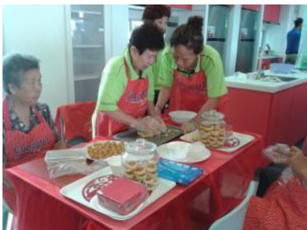
Senior citizens showing their skills

The colourful 160sqm centre is a 60-person centre established by Montfort Care at the void deck in Marine Parade, with a communal kitchen at its nucleus. Seniors are empowered to plan and cook their meals. Everyone is expected to participate for meal times; in food selection, shopping, preparation, cooking and eating. The focus of GoodLife! Makan is to reach seniors with limited socialising opportunities, provide access to healthy food, life skills empowerment, social interaction and community development.