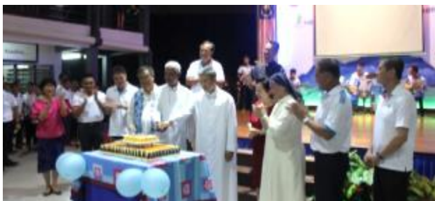
Cutting of the Tercentenary Cake by Brothers joined by Board Members and Religious