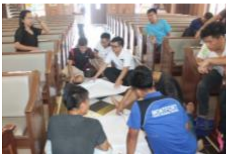
MYTC's Study Day

On 29 th February 2016, Montfort Youth Training Centre launched the Tercentenary Celebration to mark the 300 th year of the death of Saint Louis Marie de Montfort and the Founding of the Brothers of Saint Gabriel with the theme, "It is the Spirit that gives Life" which is taken from John 6:63. This quote fully the spirit of Montfort that is still moving in the institutions that were founded in his name. Montfort who only lived 43 years and died 300 years ago continues to inspire many men and women to reach out to the neglected people in the midst.