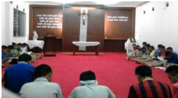
Praying the Rosary in the Chapel