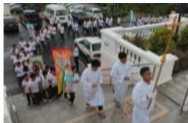
Procession and entrance into the chapel