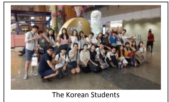
The Korean Students

In 2015, our Assumption Baking Production Kitchen commenced operations. Students at this production kitchen work to a rigorous production schedule, supplying The ART with its daily needs for baked products, as well as cake and pastry orders by customers, partners and other stakeholders. Students also manage one stall at our school canteen, selling baked items and hot beverages.