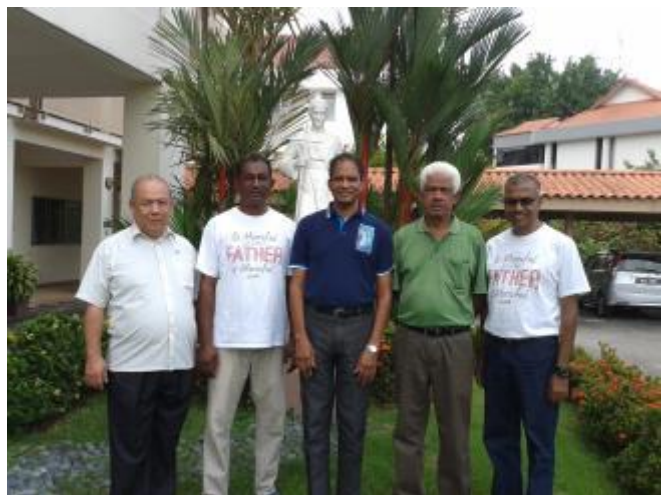
The New Leadership Team

As you flip through the pages of this Issue of our Province Bulletin, you will see the spirit of Montfort coming alive in the vibrant and multi-faceted activities among the Youth being carried out in the respective Montfort Schools and Institutions in our Province. In all things, I give thanks to God for each one of you. You will all remain in my prayers.