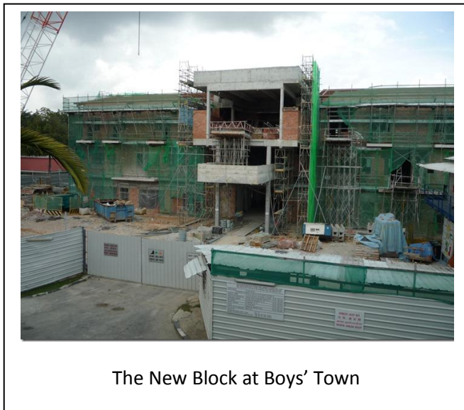
The New Block at Boys' Town

A S$15,000,000 project is on and phase One should be completed in April 2012 or thereabout. This will be the Administrative Block, the Quarters for the Brothers for as long as we have any in Singapore and some dormitories. This first phase will cost us about S$8,000,000 dollars and the Second Phase will cost us some S$7,000,000.00 a good part of it has been collected already and much more is to be found.